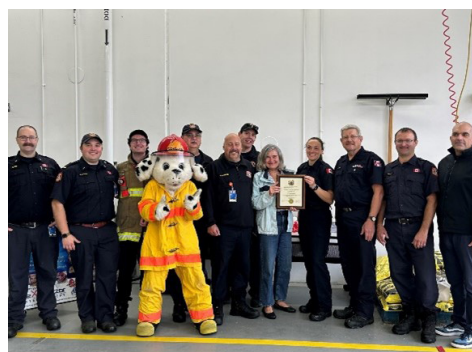
Celebrating the 50th Anniversary of Fire Station 60 in Herring Cove.