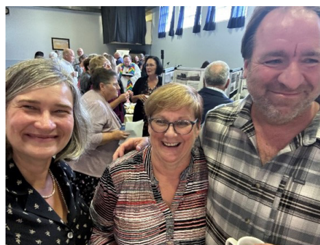
Celebrating Sambro receiving the Lieutenant Governor's Community Spirit Award.