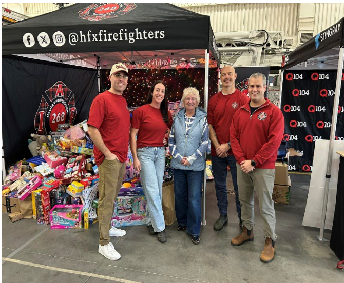
It's a Toy Drive! Thanks you HRFE Professional Fire Fighters