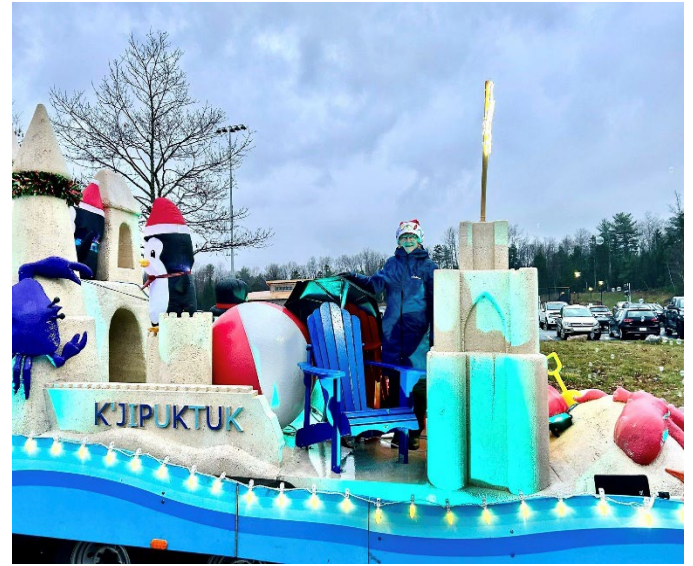
Thankful to our staff who ensure our Parade Float is on time and has BUBBLES