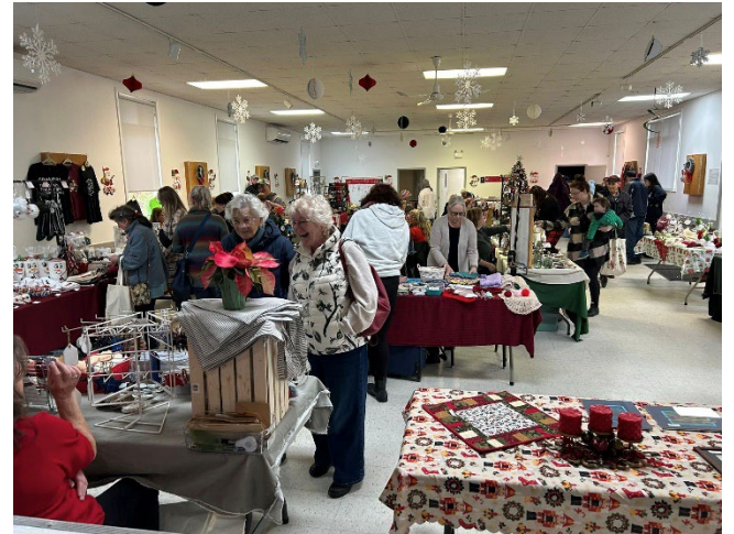
Shopping Local at many Craft Markets