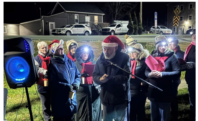
Countdown to Tree Lighting on Waverley Green