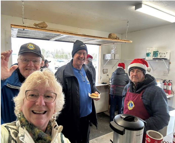
Musquodoboit Valley & Area Lions Club at the Christmas Ex!

WAVERLEY - FALL RIVER - MUSQUODOBOIT VALLEY