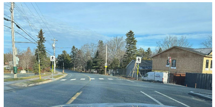
A new Crosswalk at McPherson and Lockview