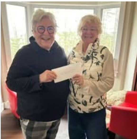
Donation to the Musquodoboit Valley Food Bank