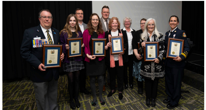
Congratulations to our District 1 Volunteer Award Recipients!

Delivery Note: Due to the delivery routes followed by Canada Post, it is possible that some of these newsletters may appear in other Districts. If you receive it in error, I apologize for any confusion and I hope you find this information useful.