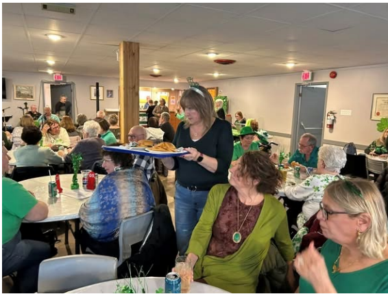
Lots of folks came out to celebrate the day at the full house event hosted by The Waverley Royal Canadian Legion Dieppe Branch 90, with many wearing their green.