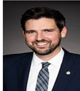
MP Sean Fraser

Central Nova House of Commons Ottawa, ON K1A 0A6 Phone: 613-992-6022 Fax: 613-992-2337