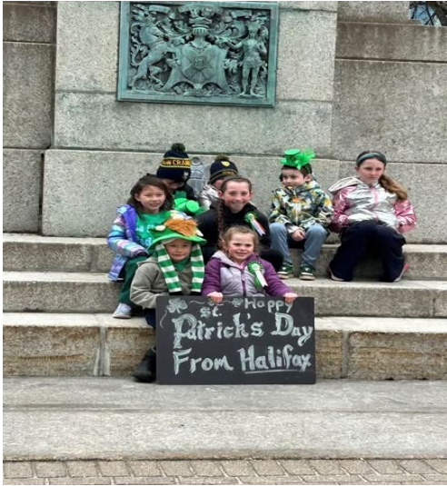
The children were very happy to be participating in the celebration!

WAVERLEY - FALL RIVER - MUSQUODOBOIT VALLEY