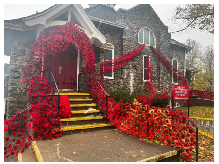
Poppy Tribute Show in support of our service men and women.

Given that many municipal programs, services and responsibilities directly affect lake health and water quality, the municipality is uniquely positioned to monitor water quality and address emerging issues, as well as ongoing concerns. For more information, read the <u>staff report</u>.