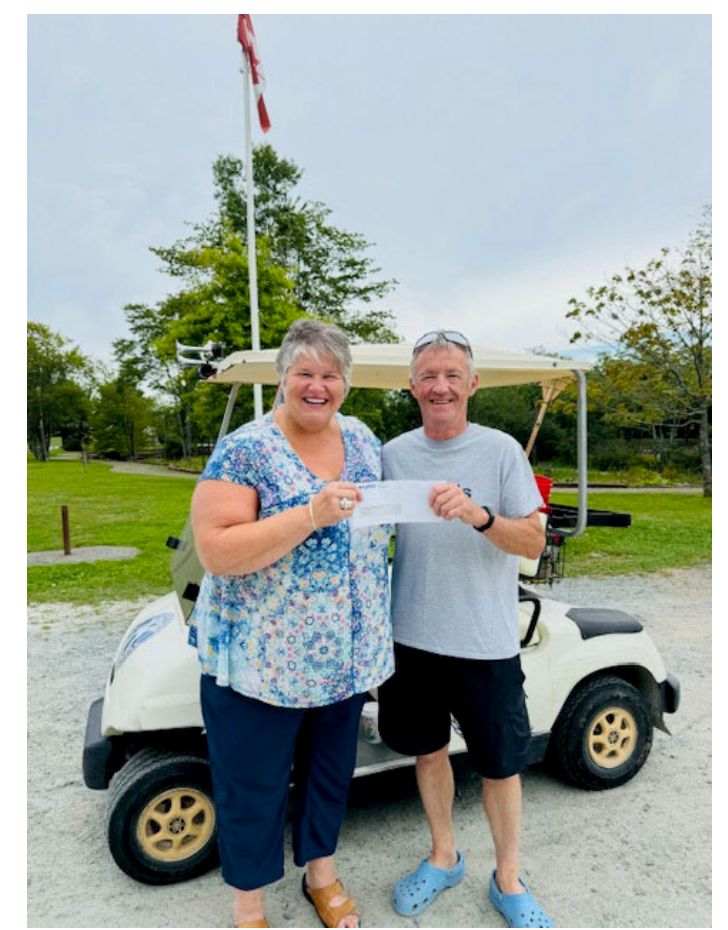
Presenting a donation to the Kiwanis Club for Park Beautification

For more information on the municipality's Open Data program, and to access all the datasets, visit the open data <u>hub</u>.