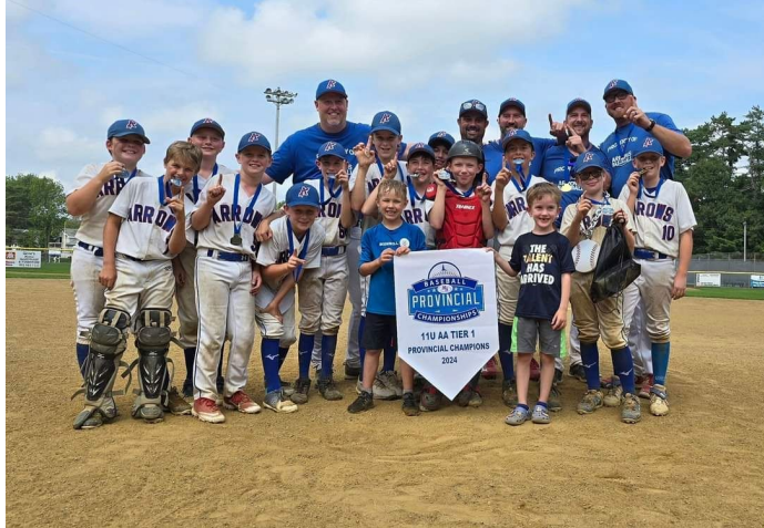
Sending a shout out to the Arrows 11U AA team who captured their provincial title this summer!