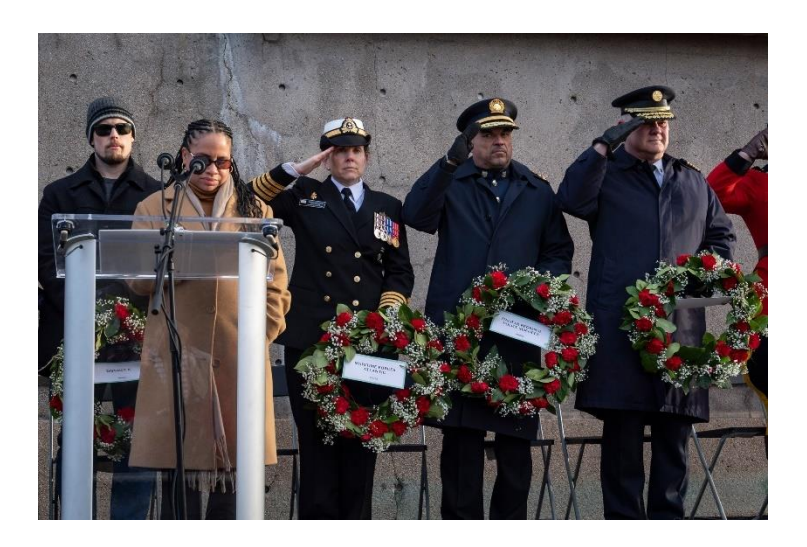
I was proud to have emceed the 107<sup>th</sup> Memorial Service of the Halifax Explosion on December 6