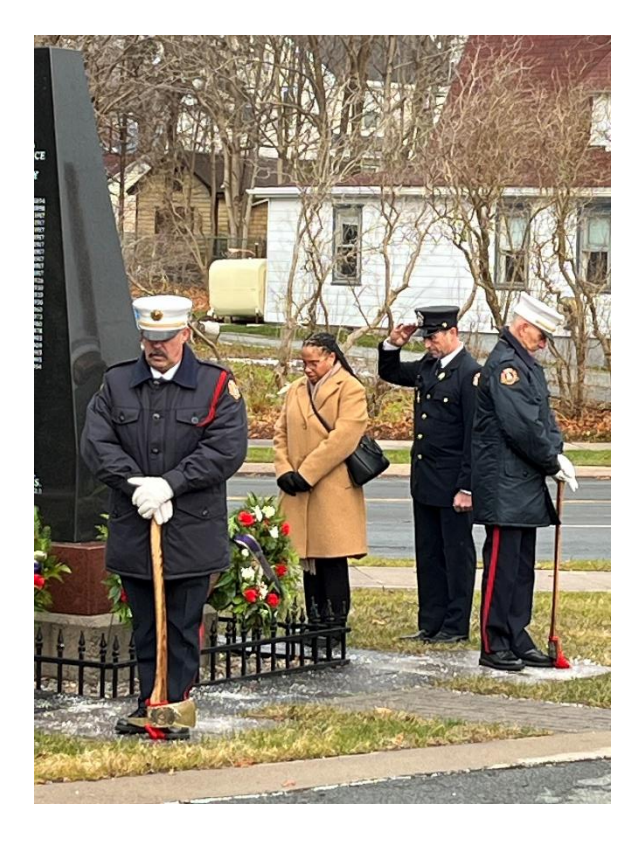
I was proud to have attended the Annual Firefighter Line of Duty Death Service at the Duffus Street Fire Station