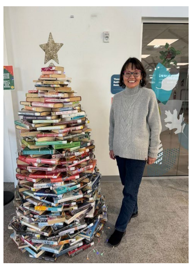
I couldn't resist getting a picture by the book tree at the Keshen Goodman Library in December!

For more information on electric vehicles and charger types, <u>click here</u>.