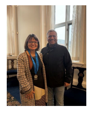
Clayton Park residents attending the New Year's Levee at Halifax City Hall