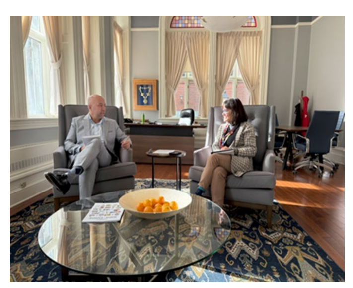
My first meeting with Mayor Fillmore

For more information, visit our website.