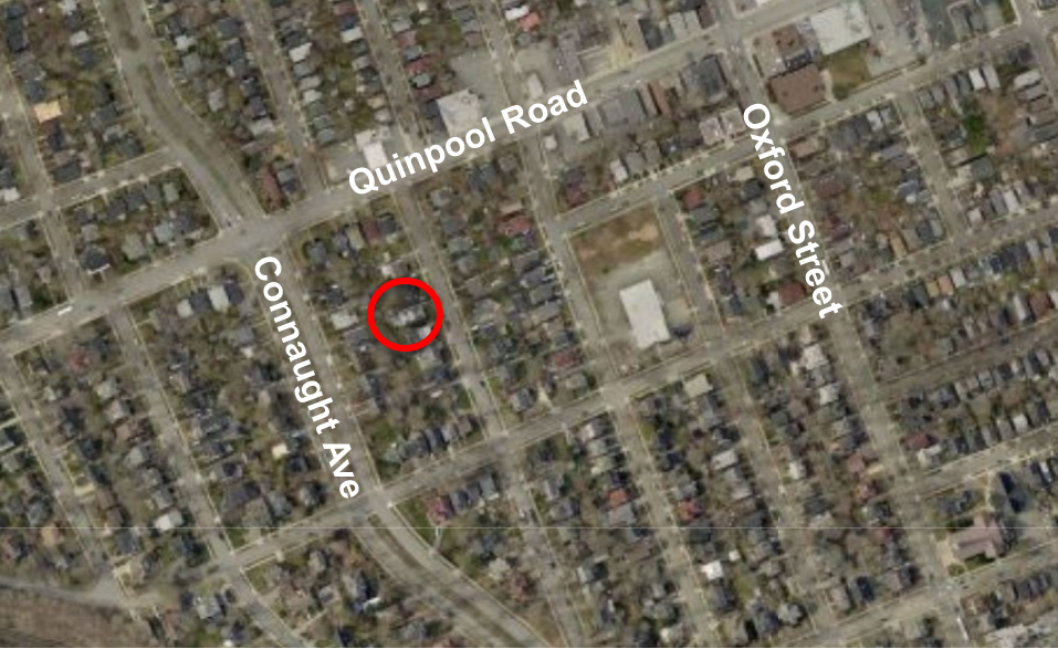
General Site location in Red