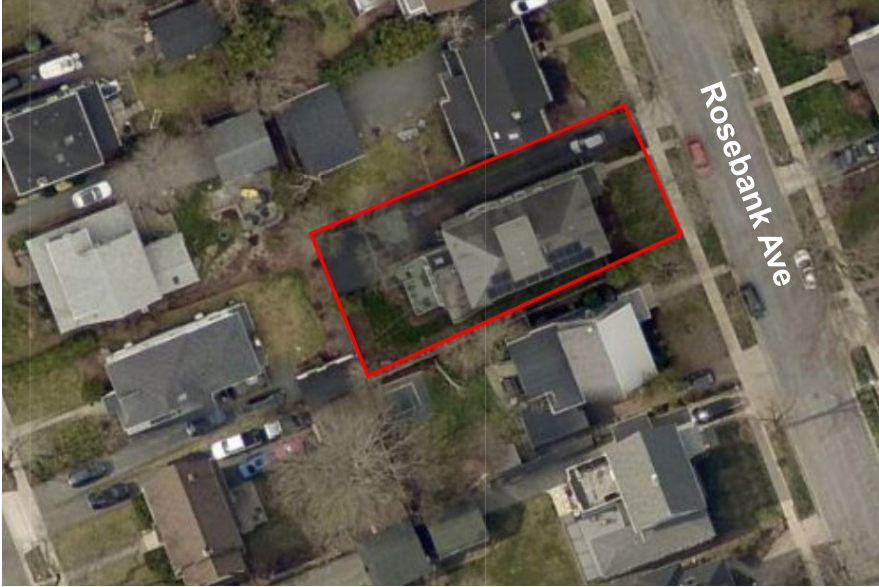
Site Boundaries in Red