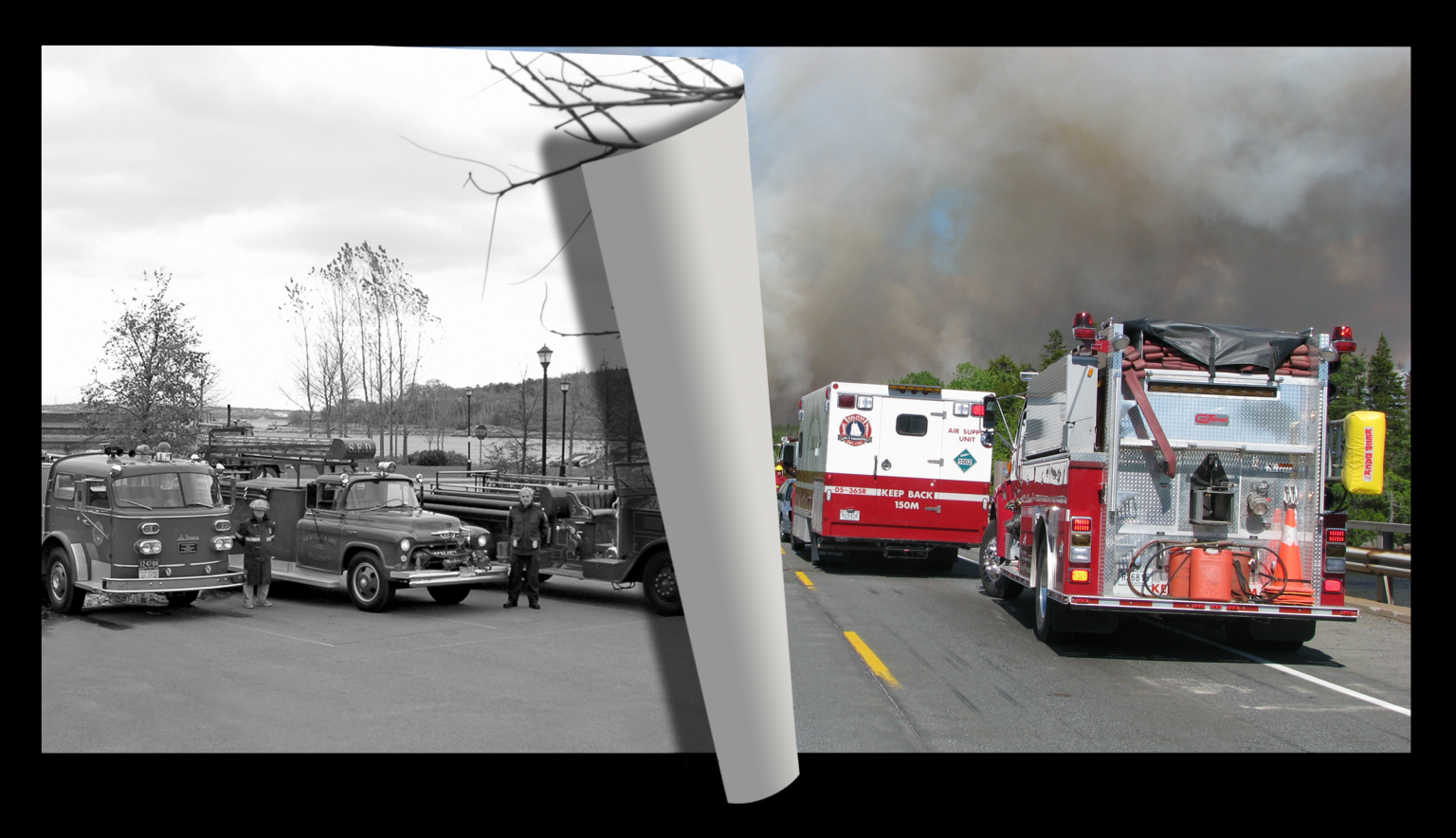
Planning for Change • Seizing Opportunities • Safeguarding our Future