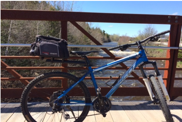
Cst. Botham parks her bike on patrol Bedford Sackville connector trail with the trail warden to examine safety concerns of the trail.

Following complaints about motorists driving too fast in the area, the Musquodoboit Harbour RCMP have been setting up a portable radar trailer along the Eastern Shore. The portable radar has been well received by the community, who see this tool as a way to remind motorists to slow down. The day after the media release on this initiative 29,304 people looked at the post of Facebook! It got 198 likes and 142 shares all in 23 hours! May Long Weekend is soon upon us and marks the start of cottage season. Police data over the last 6+ years shows this to be one of the top 3 holiday weekends for Impaired driving and Collisions. May 20 th is National Impaired Driving Enforcement Day, with initiatives being planned to keep travellers safe on the roads.