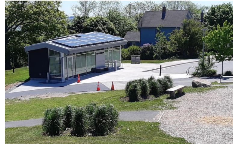
Image description: The newly constructed Fort Needham Memorial Park accessible washrooms. The building sits on a concrete barrier-free pad and has windows spanning the front side. Solar panels sit on the roof.