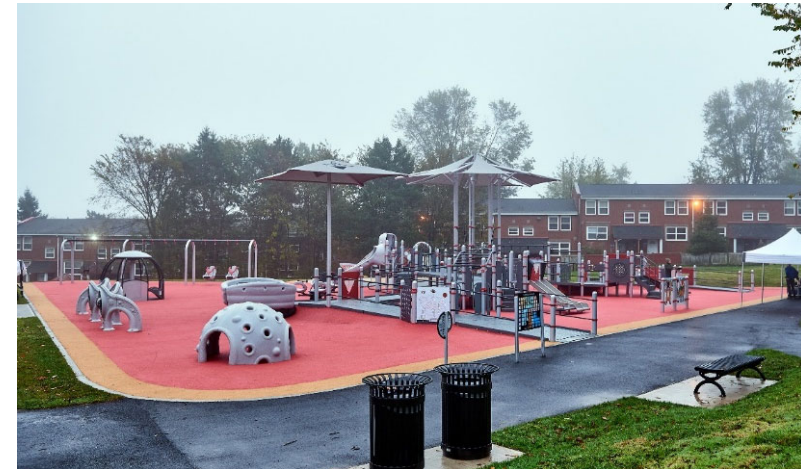
Image description: The JumpStart inclusive playground at the George Dixon Community Centre. The playground is fully accessible and is coloured grey and red. Accessible elements displayed include a ramp, swings, a We-Saw, We-Go-Around and rubber surfacing.