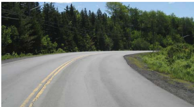
Photo 1 - Eastbound approach to proposed site access location. Note the trees obstructing sightlines on the right side of the photo.