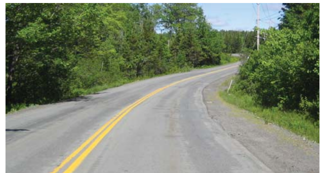
Photo 2 - Westbound approach to proposed site access location. Note the trees obstructing sightlines on the right side of the photo.