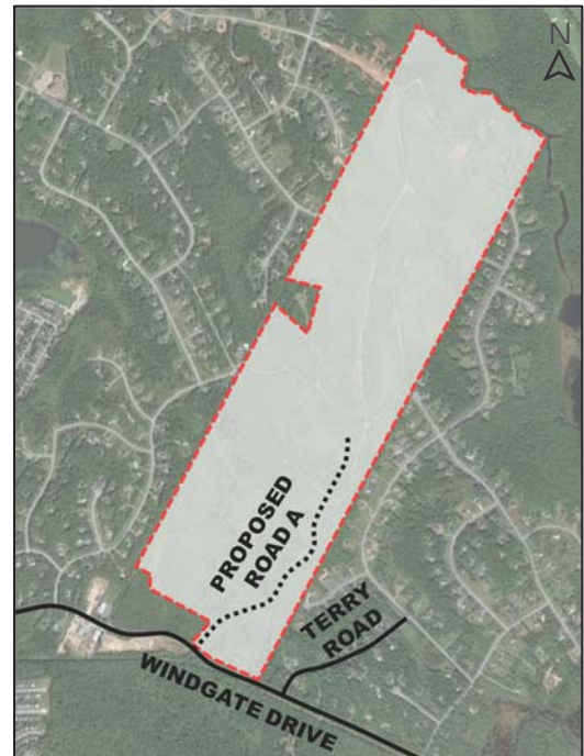
Figure 1 - Study Area

In 2017, WSP conducted an investigation into the required stopping sight distances (SSDs) along the Windgate Drive approaches. SSD reflects the distance required for an approaching vehicle to make a complete stop the instant that an object comes into view. The stopping sight distances (SSDs) were measured from a driver eye height of 1.05 m to a 150 mm object on the eastbound and westbound approaches. Using this information, it was determined that adequate SSDs were not available due to the presence of trees/vegetation (See Photo 1 and Photo 2).