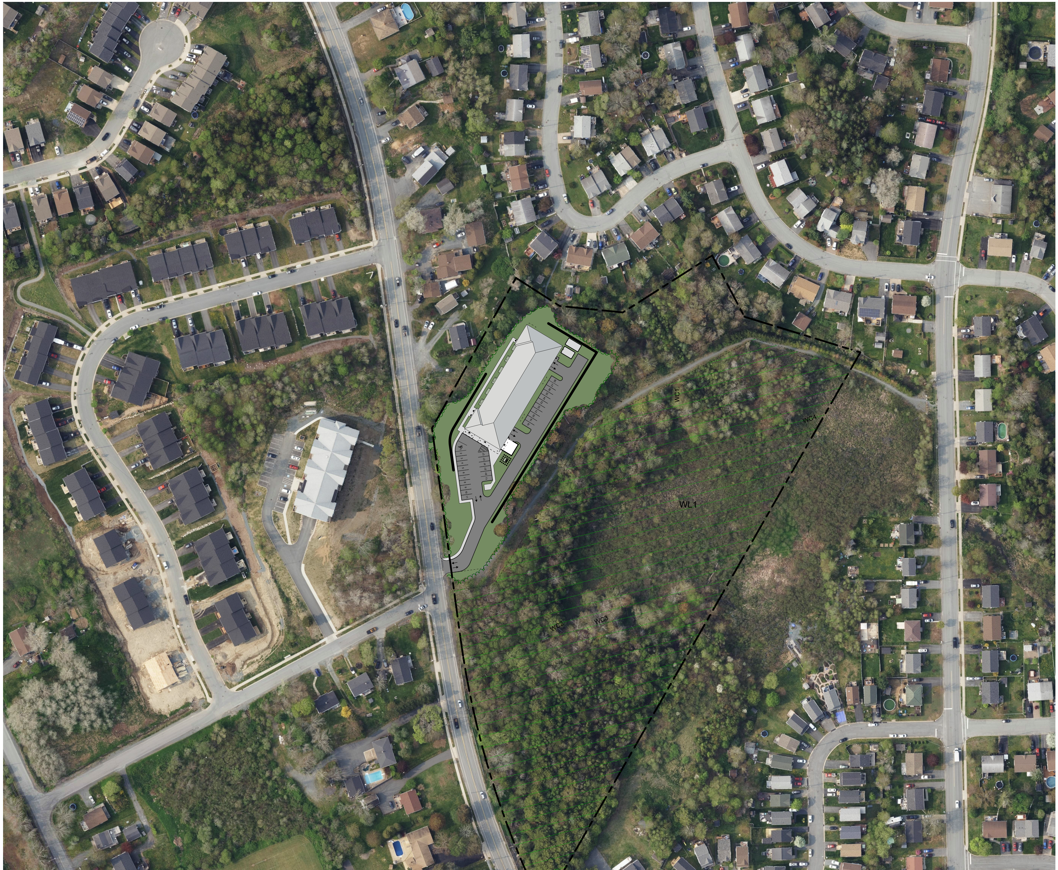
1 NEIGHBORHOOD AERIAL PLAN SCALE: 1:1000