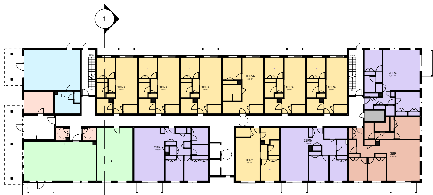
0 SECTION KEY PLAN SCALE: 1/32" = 1'-0"