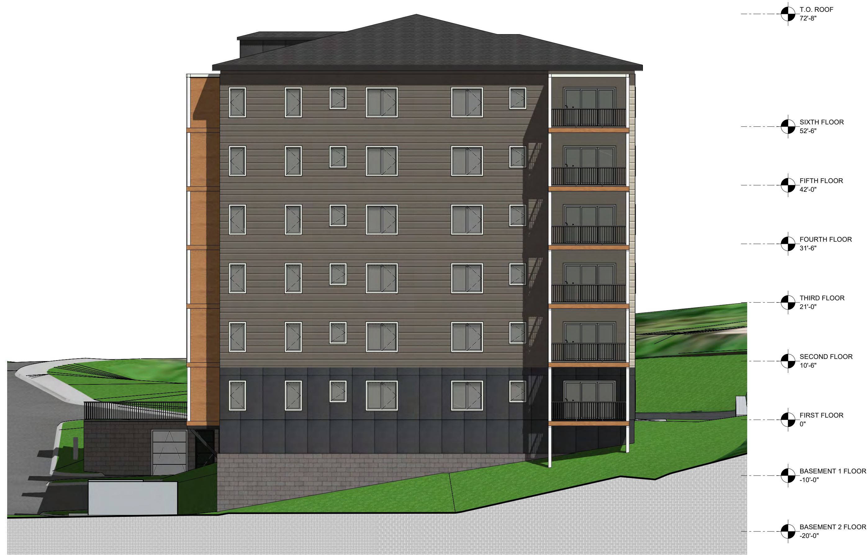
2 NORTH ELEVATION SCALE: 3/32" = 1'-0"