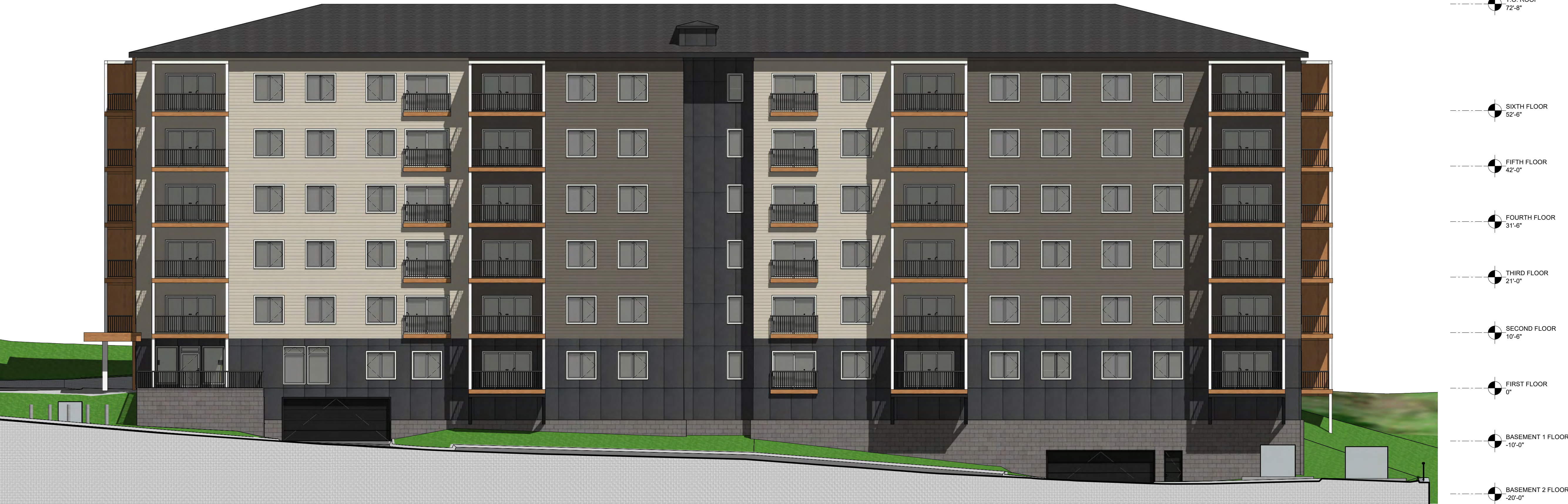
1 EAST ELEVATION SCALE: 3/32" = 1'-0"

AFFORDABLE HOUSING ASSOCIATION OF NOVA SCOTIA