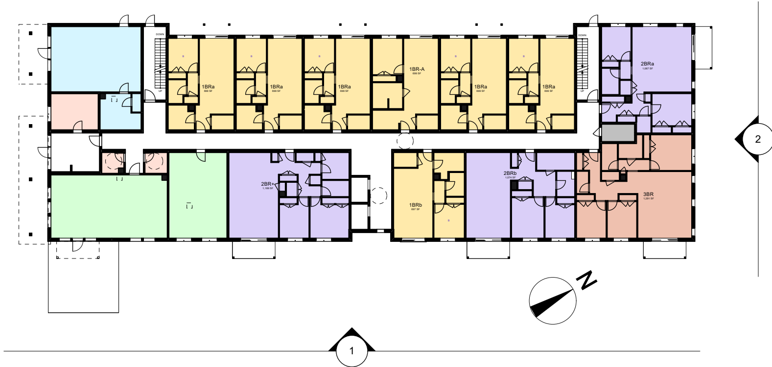
0 ELEVATION KEY PLAN SCALE: 1/32" = 1'-0"