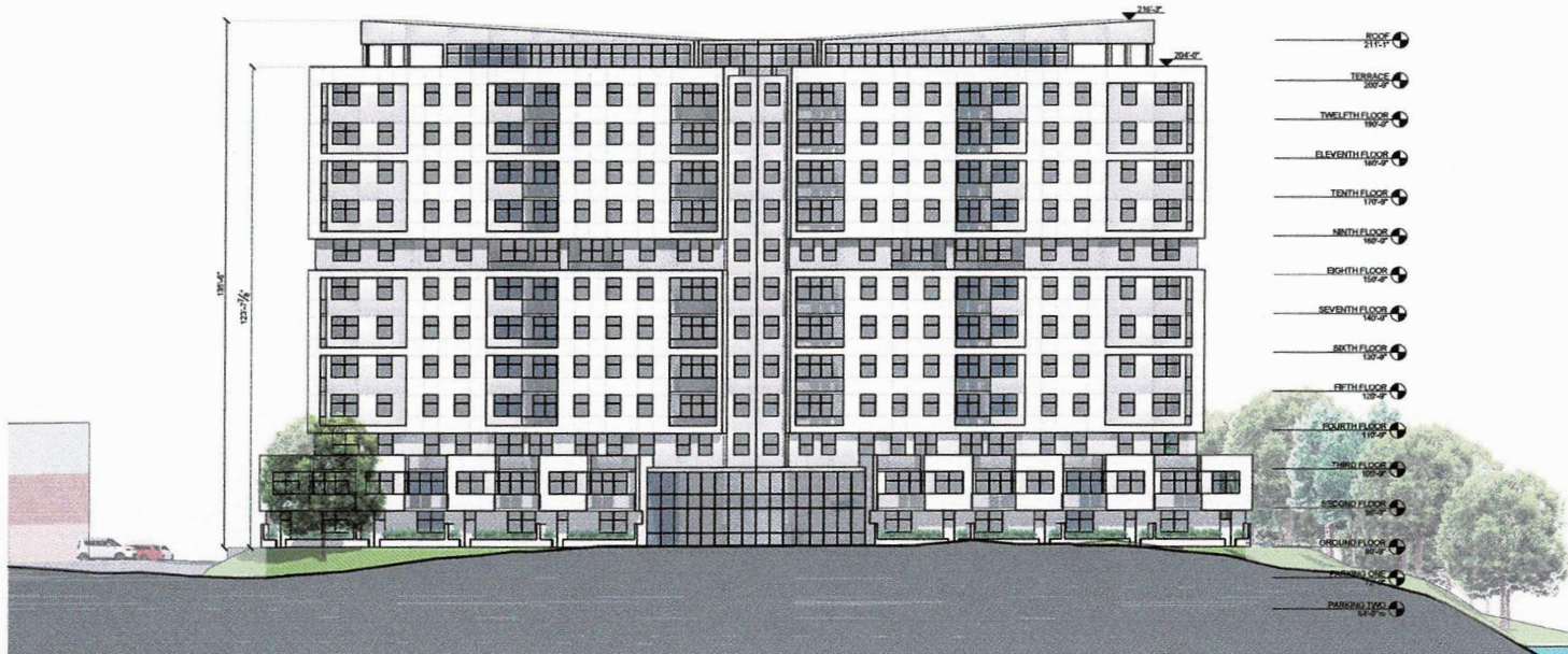
1 WEST ELEVATION 1/8" = 1'-0"