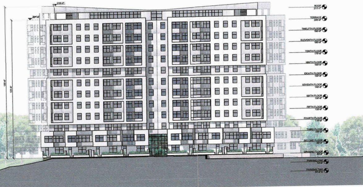
1 EAST ELEVATION 401 1/8" = 1'-0"