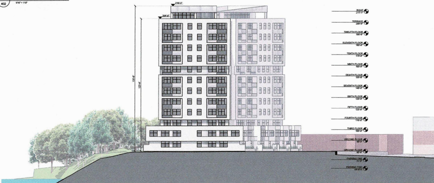
2 SOUTH ELEVATION 1/8" = 1'-0"