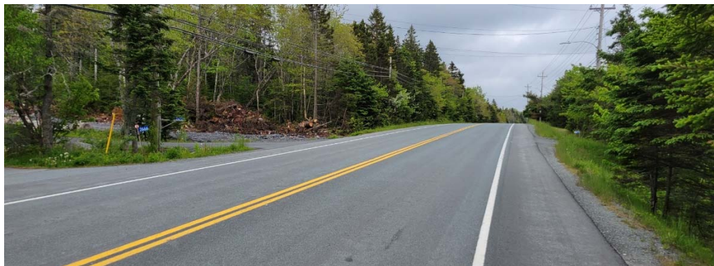
2712 Prospect Road in Whites Lake, Nova Scotia