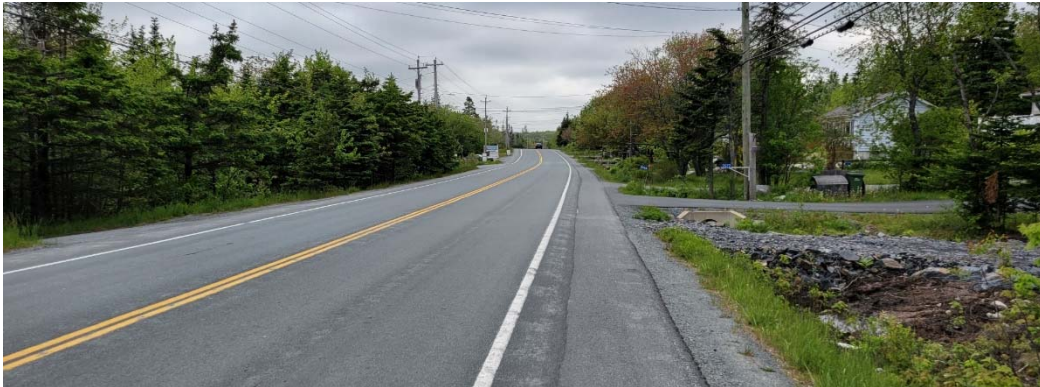
Prospect Road looking north with proposed development on right