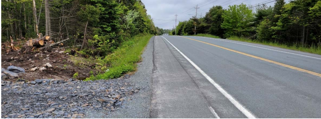
Prospect Road looking south with proposed development on left