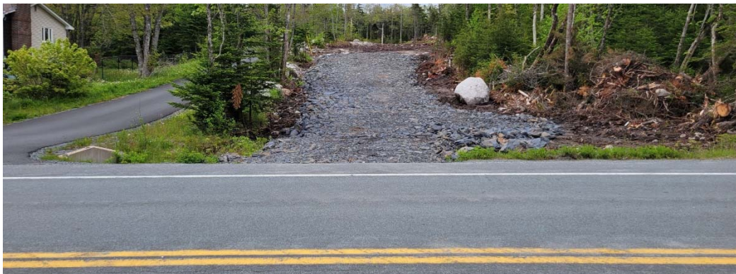
Proposed Entrance to development on Prospect Road