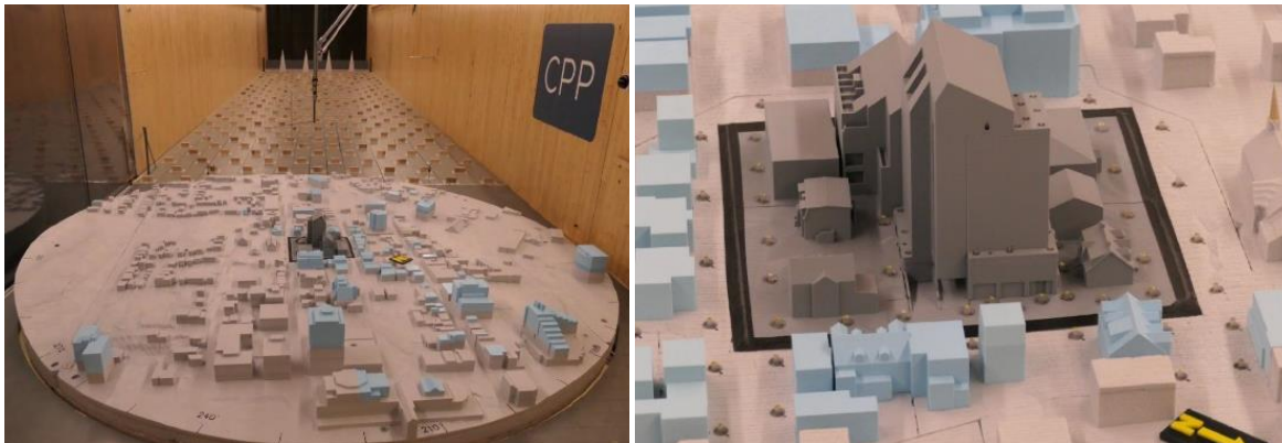
Figure 1: Photographs of Wind Tunnel Model in a CPP Boundary Layer Wind Tunnel

CPP's opinion is informed by the results of the previous quantitative wind tunnel study undertaken by CPP (findings summarized in the "Pedestrian Wind Assessment" report dated 24 June 2024) (see Figure 1 for reference) based on the 3D design information of the development received on 26 April 2024.