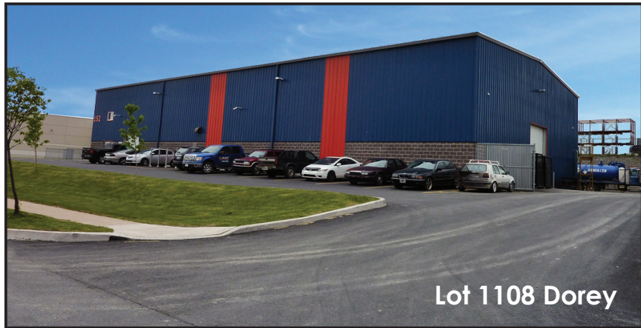
Lot 1108 Dorey

Lot 1108 (Civic # 152) Dorey Avenue - Velocity Machining & Welding Inc. call this their new home now as they settle on this 49,468 sq. ft. lot.