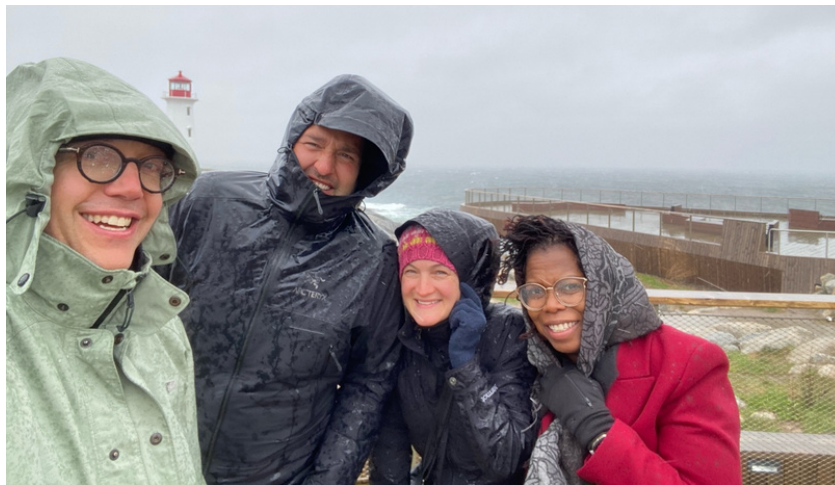
Members of the Jury on a site visit at Peggy's Cove, May 2023