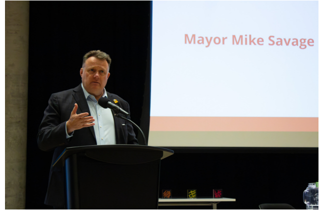
Mayor Mike Savage, also in attendance, spoke about the critical role of good urban design in our region.