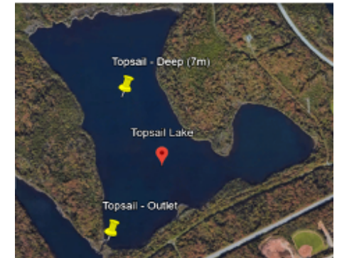
Satellite Imagery Map of Topsail Lake w/ Sampling Locations