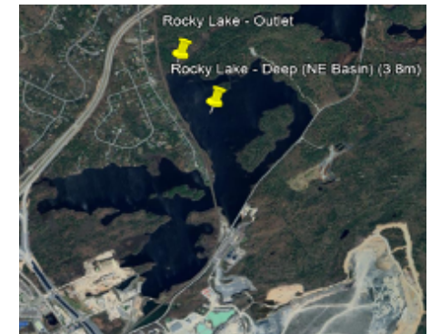
Satellite Imagery Map of Rocky Lake w/ Sampling Locations