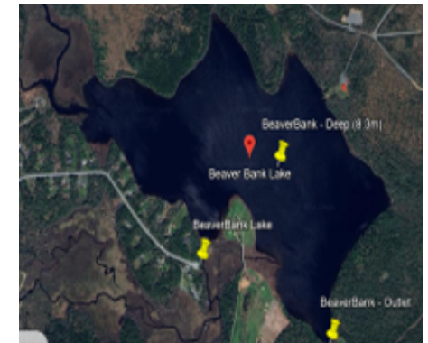
Satellite Imagery Map of Beaver Bank Lake w/ Sampling Locations

*ND = 'non-detect' for E.coli, indicating less than 2 CFU / 100 ml