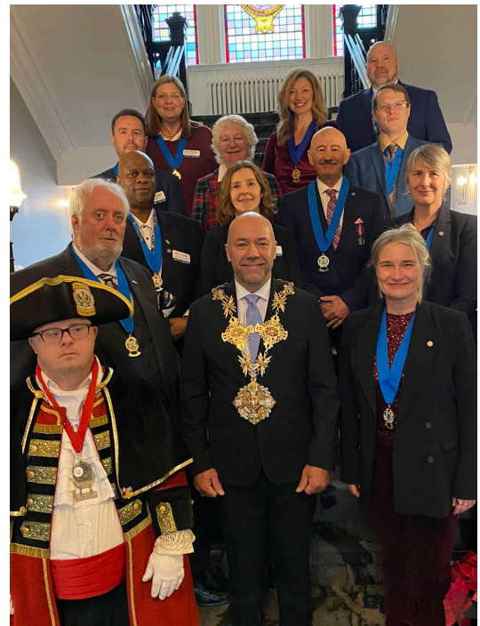
Rang in 2026 with my Council Colleagues at the annual New Year's Day Levee at City Hall.

Are you a member of one of these facilities looking for affordable access? Learn more and apply in 2026 by visiting our website .