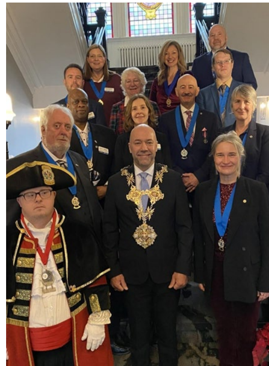
New Year's Day Levee at Halifax City Hall!

Apply by 11:59 p.m. on Friday, Jan. 9, 2025.