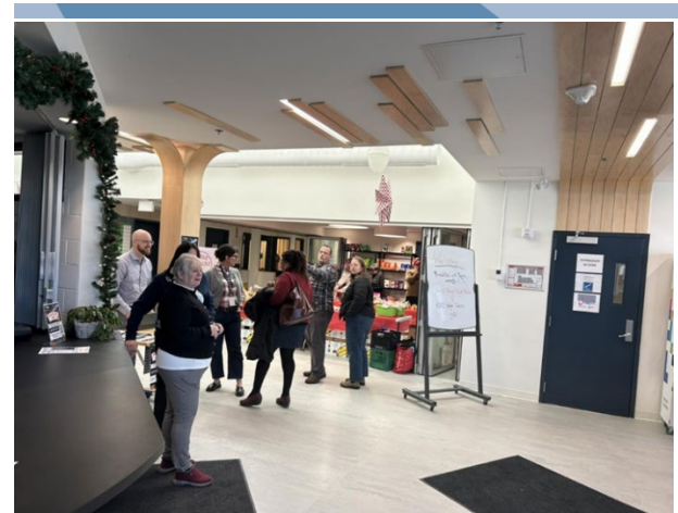
Grand Re-Opening of the East Dartmouth Community Centre

Keep an eye out for updates on their return in spring 2026. More details can be found here .