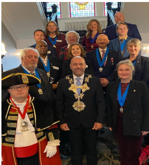
New Year's Day Levee at City Hall January 2026

For information on all things municipal, please visit our website .