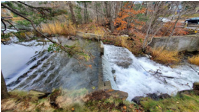
View across Chocolate Lake spillway.