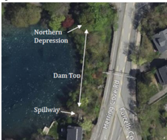
Aerial view of the Chocolate Lake spillway and dam.

Construction of the new dam is estimated to cost $4.965 million. Project completion date is projected to be late spring 2027.