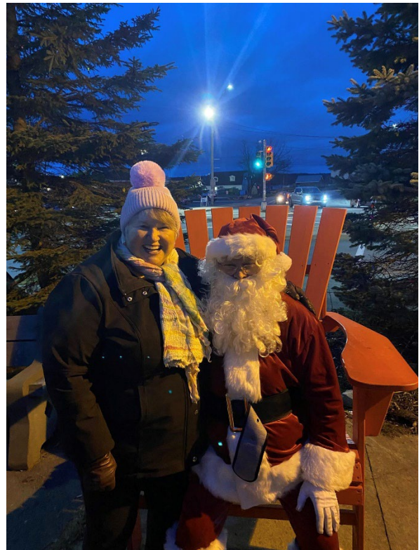
At the Eastern Passage Community Tree lighting event!

HalifACT targets reflect the urgency of the climate crisis and require bold, sustained action. Continued investment will deliver meaningful environmental, social, and economic benefits for residents, businesses, and the municipality. For more information, read the staff report .