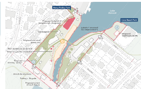
Henry Findlay Park – ICF Use