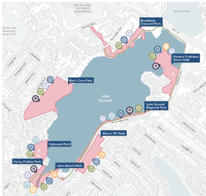
Common Park Improvements