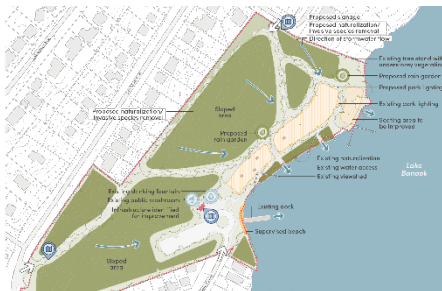
Birch Cove Park