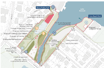
Henry Findlay Park – Community Use