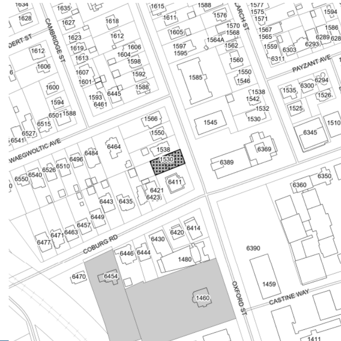
Location of 1530 Oxford Street