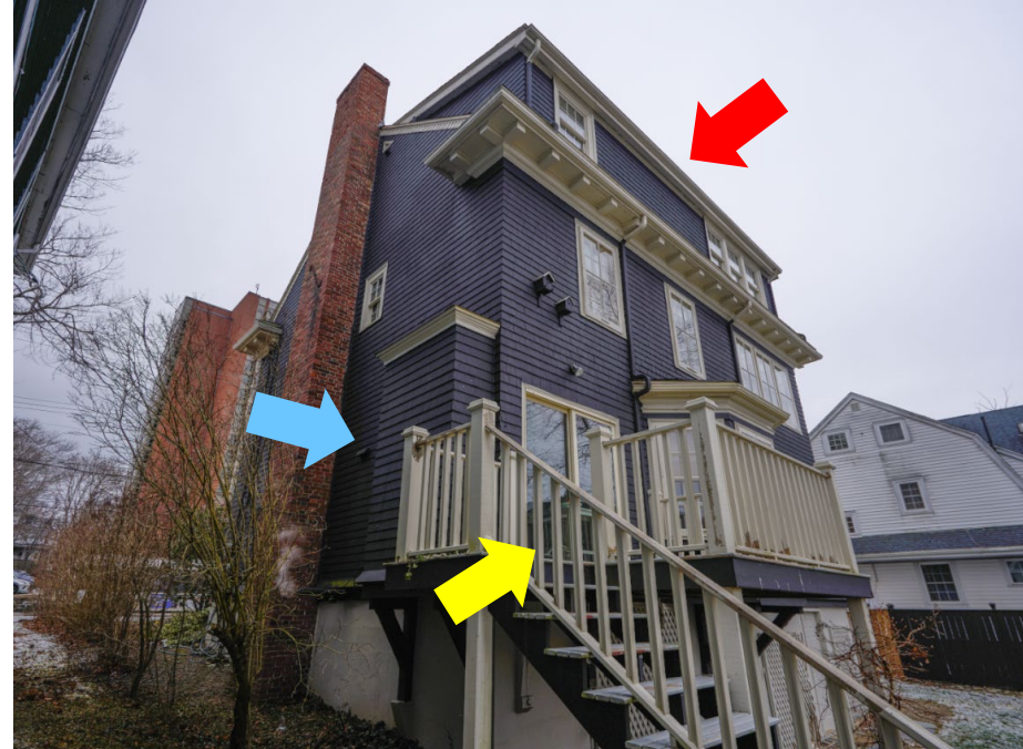
Added dormer (red), utility projection(blue), and entry alteration (yellow)