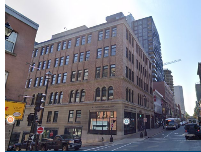
T. Eaton Store