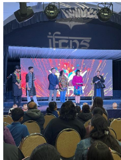
Attended the Diwali Carnival- Festival of Lights

These changes are required to comply with recent updates to federal safety regulations and must be demonstrably implemented by Nov. 21, 2025. To learn more please visit our website .