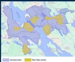
Shared micromobility pilot program phase 2

With more riders and students back to school, ride safe: follow speed limits, don't ride on sidewalks and park in designated zones.