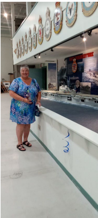
Shearwater Aviation Museum Re-opening event!

The Trades Season 3 will be filming around Woodside, Mount Hope, and at 144 Ilsley Avenue between Sept. 9 – Oct. 16. During filming, you may experience brief traffic delays and possible street closures, film equipment and crew vehicles in the vicinity, temporary signage and traffic control personnel and increased activity in the filming areas. Questions or concerns can be directed to Rob Fletcher or Ryan Rogerson .