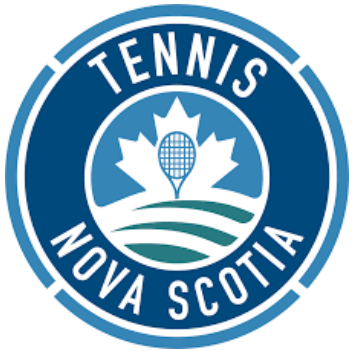
Tennis Nova Scotia