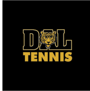
Dalhousie University Tennis Club