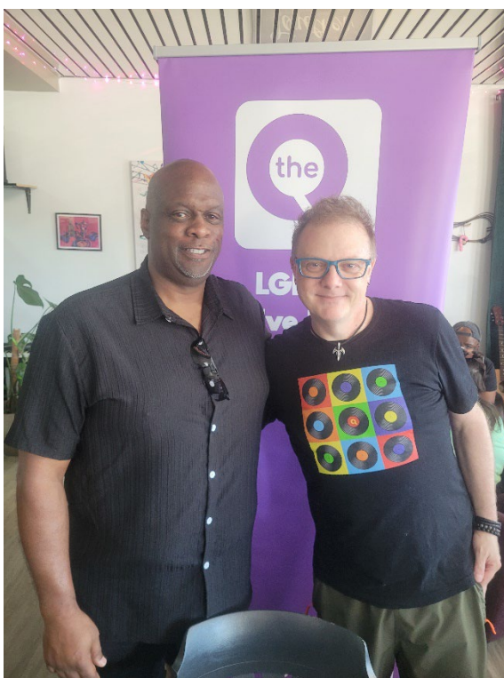
Pride Week Book Fair at the Pink Piano Sackville Drive July 26, 2025.