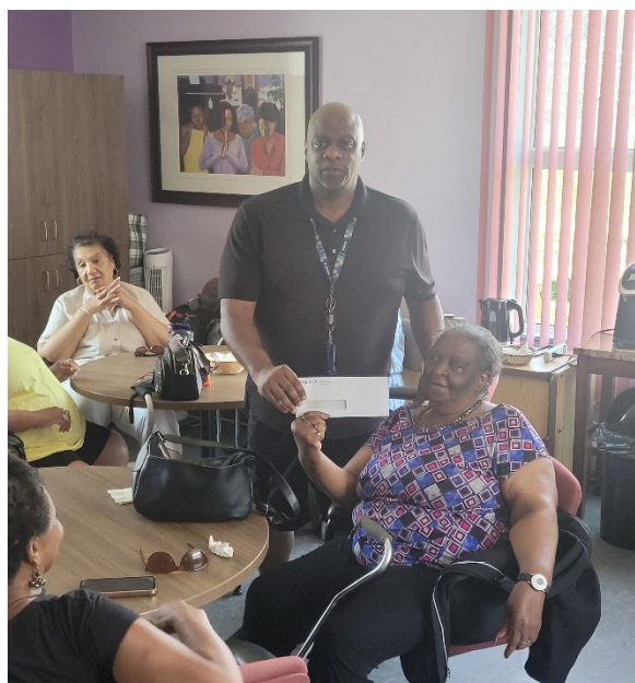
Cheque presentation to the Upper Hammonds Plains Community Development Association to support Seniors Group.