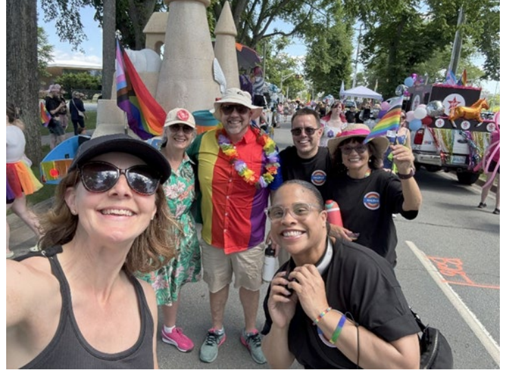
2025 pride parade with my council colleagues

For additional information on properly managing waste, visit our website . The NS Department of Natural Resources also provides information here .