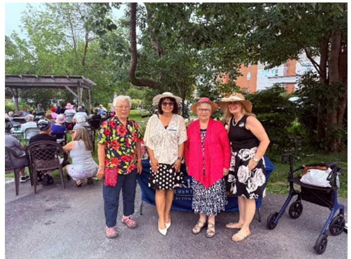
I had the pleasure of attending the Parkland Clayton Park 2025 Garden Party

The Regency Park Drive resurfacing project is mostly finished. Final clean up of the area should be completed within the next week. Thank you for your patience while this work was completed.