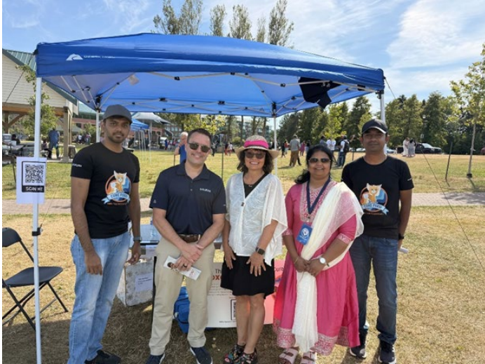
Tamil Summer Festival at DeWolf Park