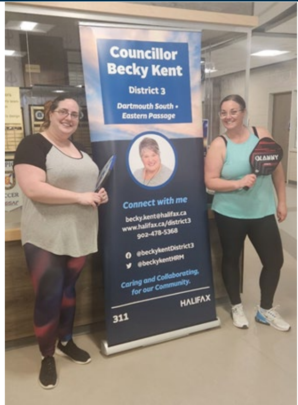
Proud to support the Island View High Pickleball Tournament fundraiser!