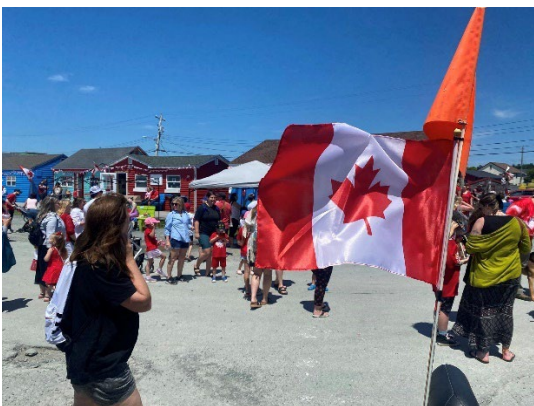
A busy Canada Day at Fishermans Cove!

Learn more and view the plan at Shape Your City Halifax .