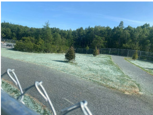
New Shearwater Flyer Off-Leash Dog Park!

The motion also included a request to break down project budgets by general traffic, public space, pedestrian, and bike lane components. A proposed amendment to include a full cost-benefit analysis was not adopted. The requested staff report is expected to return to Council in December. For more information on our bike lane network, check out our website .