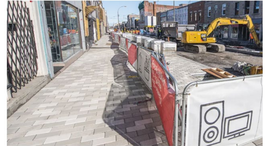
Financial assistance: businesses in areas affected by major construction work

Source: Financial Assistance Program - https://montreal.ca/en/programs/financial-assistance-businesses-areas-affected-major-construction-work