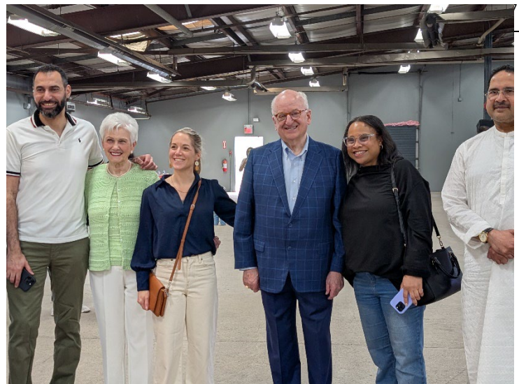
Attended the Eid-ul-Adha celebrations hosted by the Umah Society and the Muslim Community in Halifax