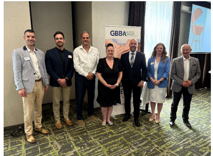
Annual GBBA Mayor’s Luncheon