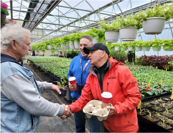
Dartmouth Greenhouse Open House