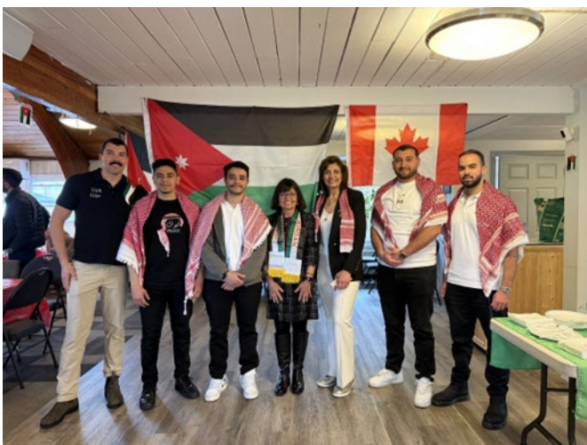
70 th Jordan Independence Day Celebration