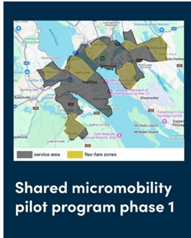
Shared micromobility pilot program phase 1

More information on flex-fare zones pricing and how to rent is available here .