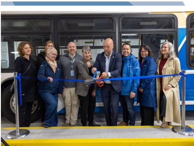
Official launch of Halifax Transit's Electric Bus Fleet