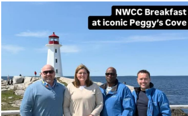
NWCC Breakfast at iconic Peggy's Cove