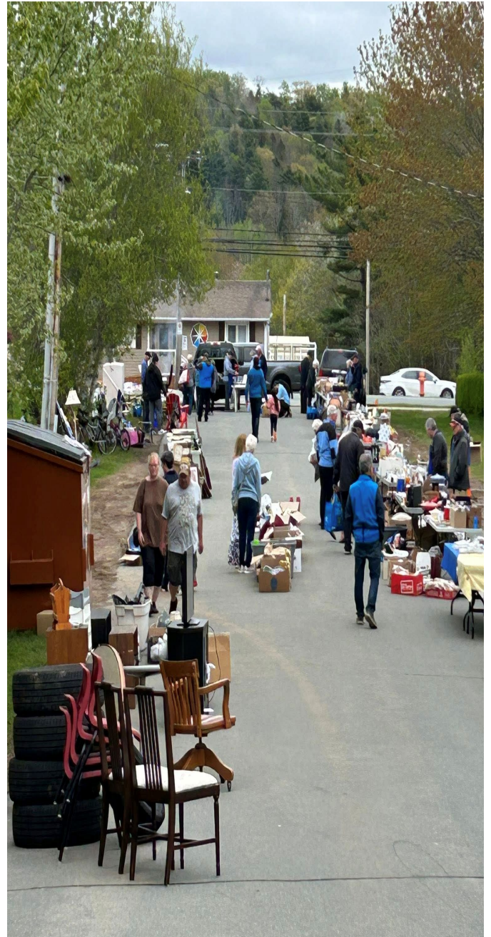
Community Yard Sale