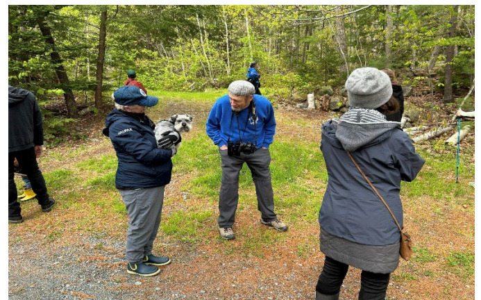
Bird Friendly Halifax Coalition Bird Walk