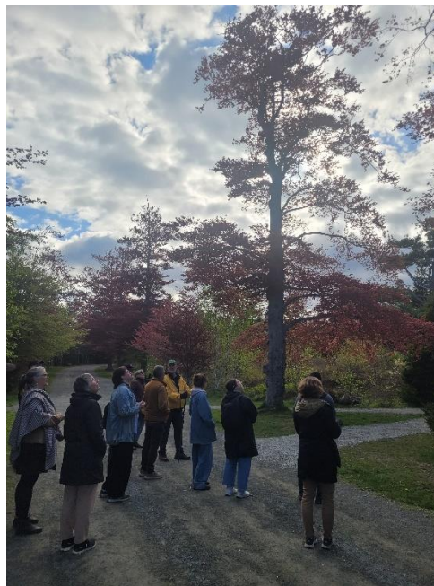
Point Pleasant Park Walkabout on Sunday, May 25.