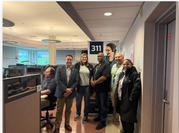
Tour of the 311 facility with my Regional Council colleagues.