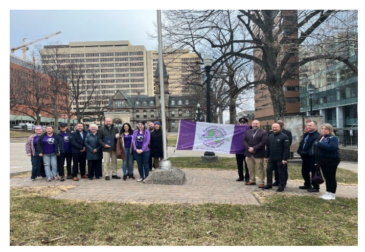
Purple Day Flag Raising