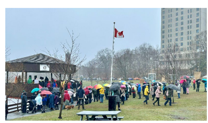
An amazing turnout in the rain to Speak Out Against Racism and Hate

Police received 16 calls from people reporting suspected impaired drivers. If you suspect someone is driving impaired, call 911 immediately with details, including the vehicle's description and direction of travel.