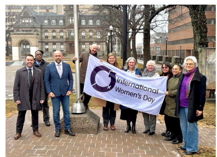
On March 8, we celebrated International Women's Day!

email landracecommunitygarden@gmail.com.