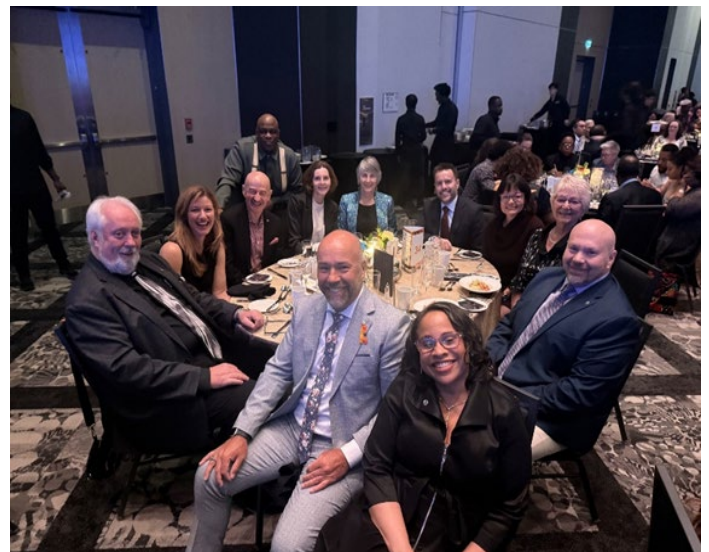
African Heritage Month Gala with Mayor Fillmore and my council colleagues

For more information, read the staff report .