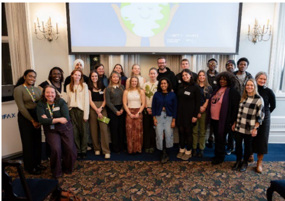
Youth Climate Action Fund Display presentation

The program provides annual cash grants to registered non-profit organizations and charities located throughout the region. There are project grants (up to $5,000) or capital grants (up to $25,000) available in the following categories: community arts; diversity and accessibility; environment and climate change; emergency assistance and neighbourhood safety; community histories; leisure; and recreation. Check out the 2025/26 Program Guidebook prior to applying and find more information about the program on our website .