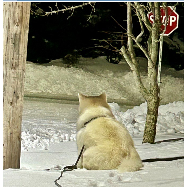
Winter is Spirit's favourite season!