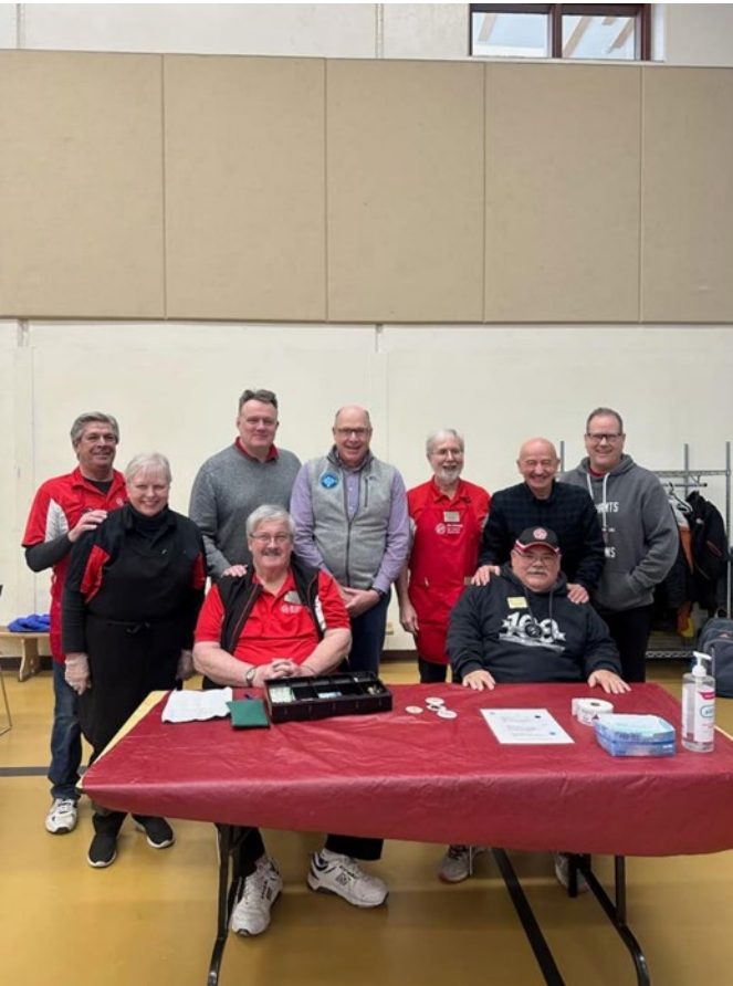
Kin Community Brunch at the East Dartmouth Community Centre!

Applications are open until Monday, March 3, 2025. Any questions about the inclusion support analysis or the advisory committee, please contact inclusion@halifax.ca . To learn more or apply, visit our website .