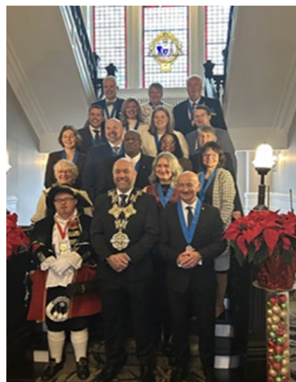
New Year's Day Levee

Each Councillor has a small fund that can be used to support non-profits to undertake activities that will benefit the community. To apply we require a letter of request, including the name and address of the non - profit group, and explanation of how the funds will be used and a completed Capital Request Form .