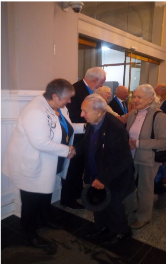
New Years Levee at City Hall

It's Crime Stoppers Month and Halifax Regional Police says that partnering with the public is key to the success of Crime Stoppers Nova Scotia. You can do your part – visit their website and see what you can do to help. Remember to always report your tips!