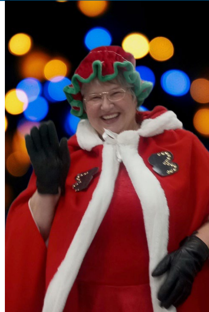
Mrs. Santa in EP Holiday parade of Lights

that includes both classroom and behind-the-wheel instruction and great benefits. To learn more, visit our website .