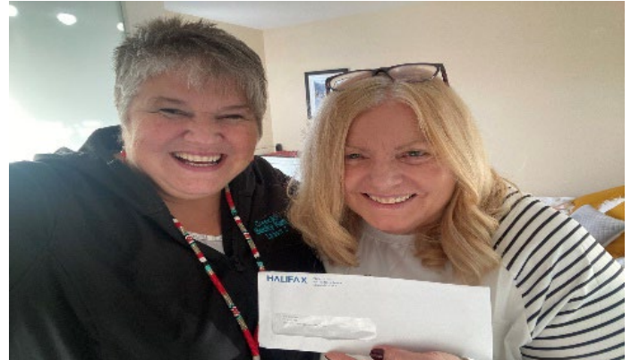
Presentation of District Capital donation cheque to support The Beacon.

You can find out more details about the process here.