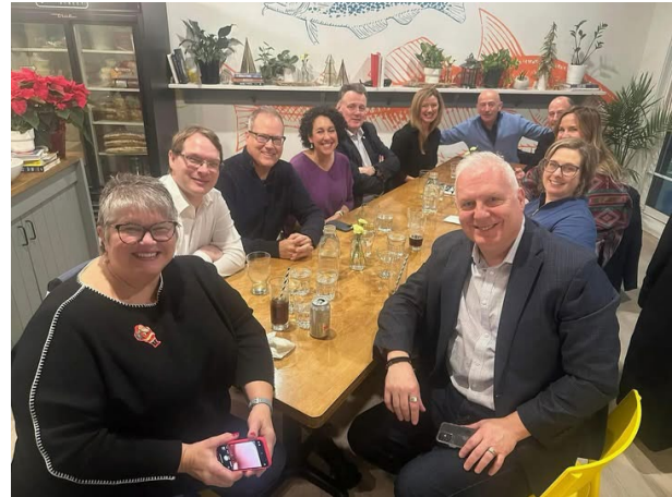
Our annual Dartmouth Elected Officials Christmas lunch - Great food and atmosphere at The Canteen on Portland Street!

This intake is for organizations requesting the addition of a property for the 2025 – 2026 tax year. You can find more information and the application form here .