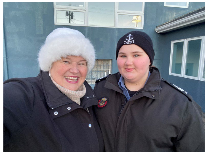
Eastern Passage Holiday Tree Lighting

Please note these dates are subject to change. For the most up-to-date information, visit halifax.ca/budget .