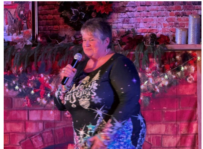
Performing in the Eastern Passage Passage Players Christmas production.

Grants are $750 for each household. You can find out more information and the application form here .