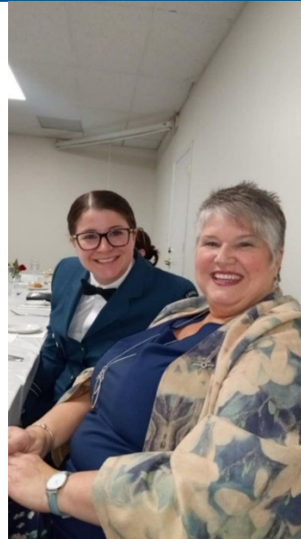
18 Dartmouth Lions Air Cadet Mess Dinner

You can find more information and the application form here .