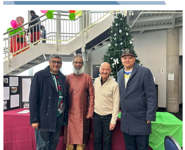
Bangladesh Victory Day Celebrations