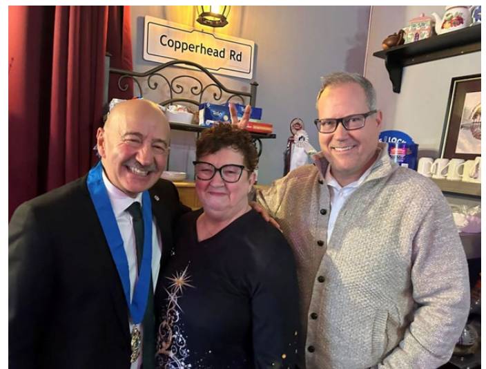
Colleen's Pub New Years Celebration!

units. The shelter village opened last week with resident intake ongoing. They are operated by the Atlantic Community Shelters Society, which manages the site and co-ordinates on-site wraparound services and supports. Each unit includes a bed, desk and storage space for personal items, with access to a shared building with washroom and shower facilities. Shared laundry facilities and a full kitchen will be available soon. Residents are selected through referrals from outreach teams in HRM and the HRM By-Name List of people experiencing homelessness, maintained by the Affordable Housing Association of Nova Scotia.